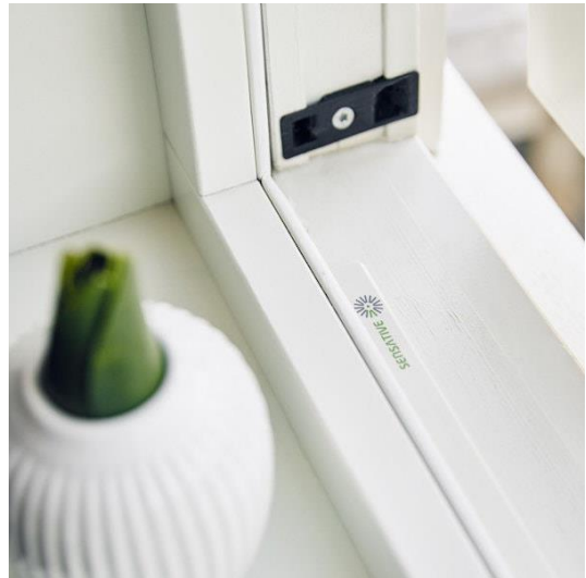
Sensative Strips Guard mounted in a window frame

Strips Guard is a contact sensor primarily used in door/window applications but with the slim design (3mm or 0.12" thick) it can be placed inside drawers, in medicine cabinets or even behind paintings to detect movement and report activity.