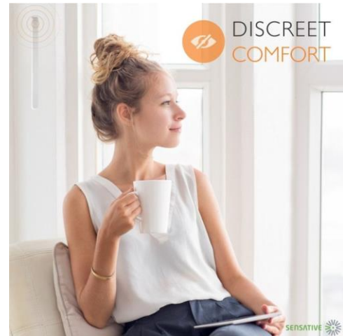
The nearly invisible Comfort measuring room temperature

Pair with lighting, shades, and even ceiling fans to create the perfect atmosphere, automatically.